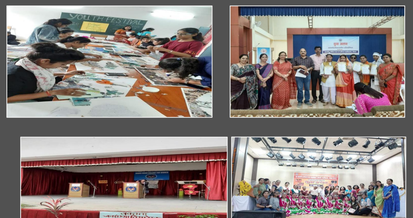
Students and teachers of the college participated in the youth marathon organized by Yuva Prakoshta of Gayatri Shaktipeeth.

Numbers of activities were organized under the flag of Youth Festival in the college premises. Students' participation was at its high. Students who were selected at college level were sent to